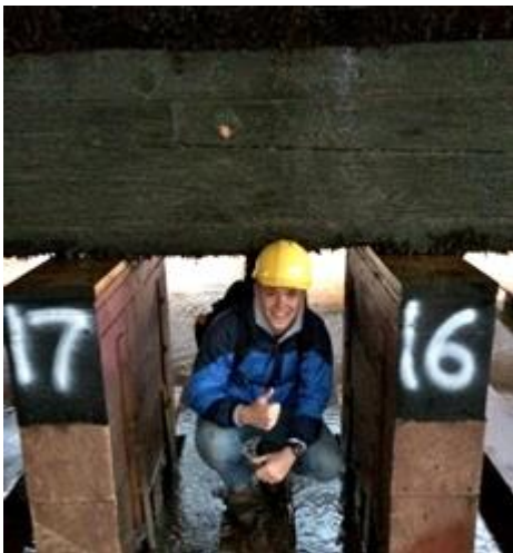
Beneath Constellation's Keel

In the spring of 2014 I was sitting in a classroom in my final semester of college. When graduation day came in late May, I had already worked as a Museum Educator for a little under a month. In late August of 2014, I was approached by Historic Ships management, and asked if I would like to be on the team for the USS Constellation Hull Repair Project. Without hesitation I accepted, not really knowing what to expect out of a tall ship dry dock project, but I was just flat out excited for the opportunity and I knew it would be a very meaningful experience.