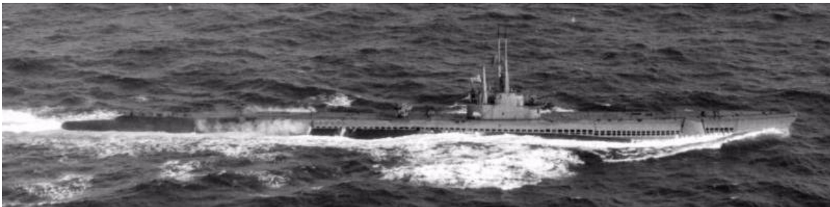
USS TORSK underway in February 1945. Note the bridge and exposed periscope shears of her original design.

Advanced as she was, TORSK still shared one limiting characteristic of all US Fleet-type submarines: her submerged endurance was strictly a function of battery charge and breathing air for the crew, typically maxing out in 24 hours and sometimes less. Most World War 2 submarines were really "submersibles" - they were capable of diving for limited periods of time, but were designed to operate mostly on the surface. While surfaced, submarines were more vulnerable to detection and attack, especially from aircraft equipped with radar - a fact which largely accounts for the decimation of the German U-boat force by Allied anti-submarine measures during the war.