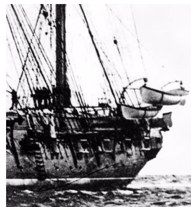
Constellation with davits and ship's boats

In addition to the ship's running and standing rigging being restored, Historic Ships staff, with the assistance of General Ship Repair and Allied Steel, are building new davits for Constellation from which to hang the ship's three small boats. The davits are like cranes which, when equipped with blocks and tackles, allow the ship's crew to hoist boats out of the water. The ship's boats, two transom stern cutters and a lapstrake double ender, were built a few years ago, and have been used for educational programs, but they have yet to hang from Constellation as they would have during her sailing days. We anticipate installation of the davits after the rig repair is complete and boats to be hanging this spring.