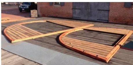
Constellation Fighting Tops

Repairs to the masts, yards and rigging of USS Constellation continue both at the Cianbro Yard and at the Douglass-Myers Maritime Park. At Cianbro, the masts and yards have received repairs and are being painted. The ship's running and standing rigging is also receiving attention here. The ship's fighting tops are being rebuilt at the Maritime Park. Materials being used are ipe and tiger wood,