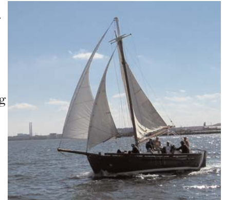
Sinbad, the Sailboat