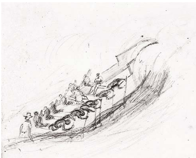
West African Kroomen in the surf, 1848.