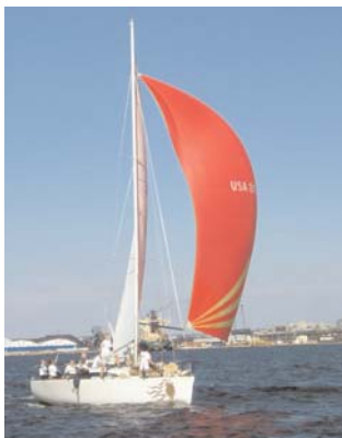
Cuore Di Leone