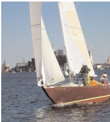
Alaris Approaches the Finish