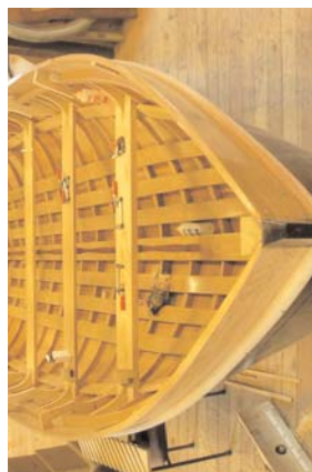
The First of Two Ship's Quarter Boats Nears Completion