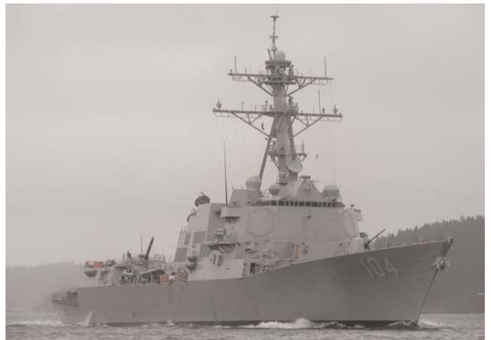
PCU (Pre Commissioning Unit) Sterett Underway on the Kennebec River bound for the Gulf of Maine and Her First Sea Trials

Almost a year ago, officers from the recently christened USS Sterett visited Baltimore on a reconnaissance mission to determine a suitable place for a proper naval ship commissioning. They were also planning on visiting Port Canaveral, Florida and Seattle, Washington. Apparently, the stars were aligned in our favor because on August 9, 2008, the USS Sterett will be commissioned here in Baltimore at the Locust Point Cruise Ship Terminal and close to 5,000 guests will witness the new ship "coming to life."