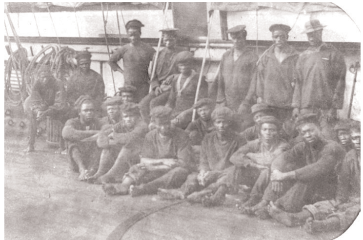
"Kroomen" from Monrovia on board USS Sacramento