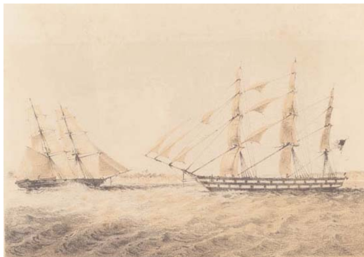
USS Perry Capturing the Slave Ship Martha in 1850

er would have discovered her embarking a cargo of Africans at the earliest opportunity. Orion's luck failed when the hapless barque was approached by HMS Pluto . When the crew threw the American ensign and her papers overboard, Pluto's officers boarded her and discovered over 850 Africans in her slave deck. Orion's mates were confined on Constellation before being transported back to the United States. The ship was ultimately destroyed but served as a potent example of the government's inability to effectively enforce the strong laws enacted to suppress the trade.