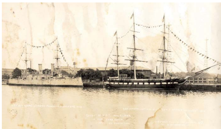
USS Olympia and USS Constellation, Philadelphia, 1926