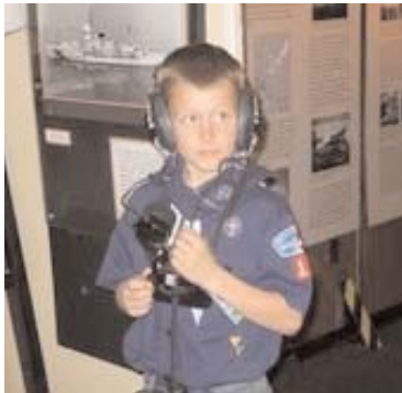
A young sailor performs damage control drills on board USCGC Taney

Since February and the announcement of the merge, museum interpretation and education efforts have been focused on creating new activities and educational programs for Taney , Torsk and Chesapeake . Four goals were quickly established, given the highest priority, and became the focus of most of the Education and Interpretation Department's spring efforts. The first goal was to develop a new cadre of motivated and qualified interpreters and educators. The second was to redesign the Taney and Torsk overnight programs and to provide them with excellent educators. The third was to design an entirely new summer SuperKids Camp program by May (in time to submit a proposal for this summer) that would utilize each ship and offer Baltimore City's second graders a new enrichment site for reading and interpersonal communications development. The fourth, but by no means least goal was to ensure that in pursuing the first three goals, there was no detracting in the quality of interpretation or education already long-established aboard Constellation . It is my pleasure to report that we accomplished each goal.