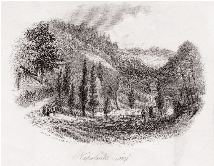
Napoleon's Tomb. Napoleon's Tomb, St. Helena

Just before Christmas, Constellation sailed for the British Island of St. Helena. The flagship spent most of January, giving the men of the ship's company a long-awaited liberty. The sailors imbibed at local pubs such as the Heart of Oak, the Spotted Dog, and the Jolly Tar, visited the dancing halls, drank with British soldiers garrisoned there, and climbed the famous "Jacob's Ladder" to