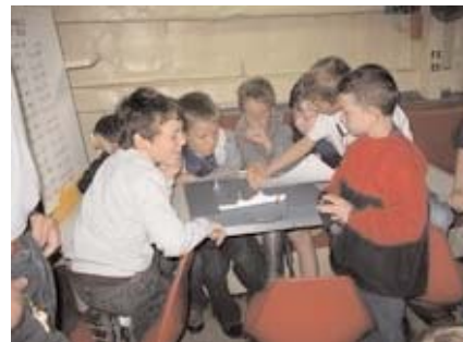
Having fun learning how to signal ship-to-ship on board USCGC Taney

Interpretive staff at all the sites. Finally, but again, not in any way of least importance, we intend to do these things while ensuring that the current high qualitative level of programming remains.