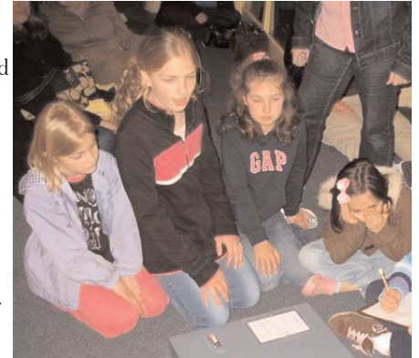
Girl Scouts performing signal drills on board USCGC Taney

learn the parts of the ship, nautical terms, and shipboard commands and expressions. For example, the first activity is a word association game, "Sailor Says," which employs rhyming, association, and movement to teach basic twentieth century nautical vocabulary. Students begin building a fund of vocabulary knowledge that grows with each presentation, tour, reading, and hands-on activity and culminates at the end of the week with a Morse code activity using words they've learned and fun coloring exercise where students choose a ship to draw and decorate. Other subjects of focus are introductory chart reading, hands-on navigation, and build-a-boat buoyancy.