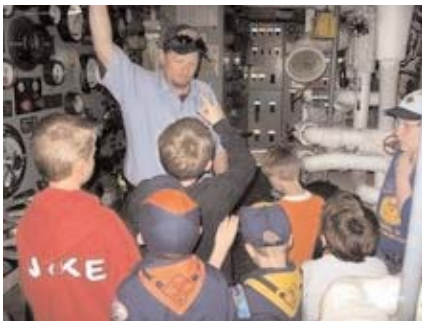
A Scout Troop explores USCGC Taney and learns from her crew all about the engine room.

Torsk , Taney , Chesapeake , and the Seven Foot Knoll Lighthouse will be SuperKids Camp enrichment sites for three weeks and Constellation will have campers on board for four