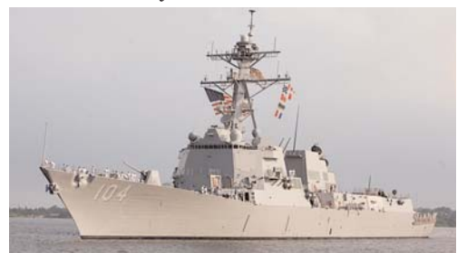
USS Sterett Enters Baltimore Harbor

USS Sterett