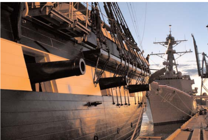
USS Sterett and USS Constellation Bow-To-Bow Just Prior To The Commissioning, August 9, 2008

USS Sterett