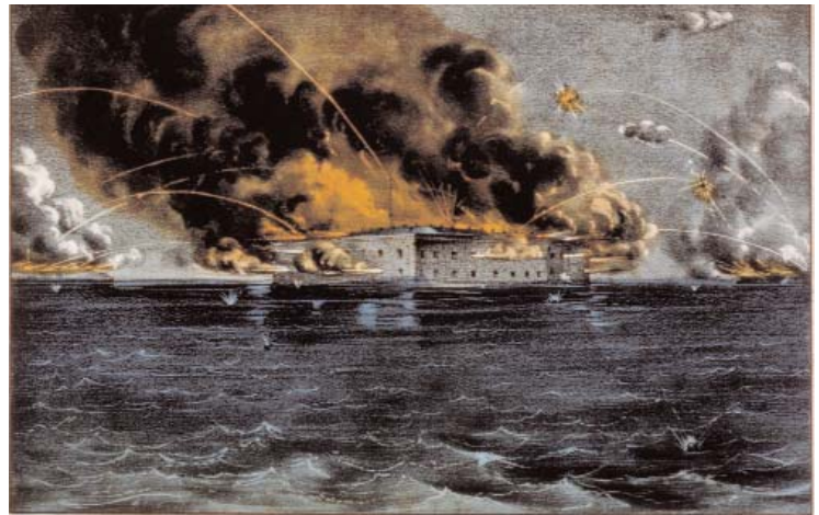
The Bombardment of Fort Sumter

On the evening of June 7, Constellation anchored in the harbor of St. Paul de Loando after a cruise at the mouth of the Congo River. The harbor was crowded with merchant vessels and men of war from many nations. One of these vessels, a Portuguese mail steamer, carried the news of Civil War in America. Likely, illustrated newspapers depicting the bombardment of Fort Sumter passed from man to man almost as quickly as the shouts of outrage. The men learned that on April 13, 1861, the garrison at the South Carolina fort surrendered to Confederate forces after a barrage that lasted thirty-four hours. William Leonard reported that the news, "creates an intense excitement among the fleet. The ship is like a madhouse through