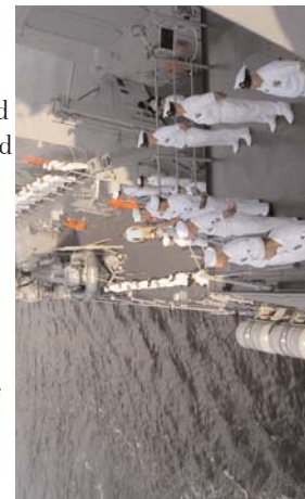
Sterett Crew Rendering Honors To Ft. McHenry, Baltimore Harbor