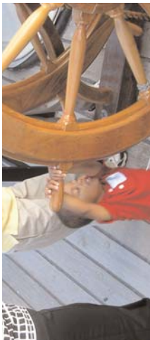
Two Young Members Of The Taylor Family Try Their Hand At The Ship's Wheel

Special thanks to Absolutely Perfect Catering and Loane Brothers Tent and Party Supplies for their support of this event.