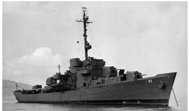
USCGC Taney - 1944 configuration as Flagship, Task Force 66, on Atlantic and Mediterranean convoy duty

USCGC Taney , the last warship afloat to witness the Japanese attack on Pearl Harbor on December 7, 1941, is an honorary member of the Pearl Harbor Survivors Association.