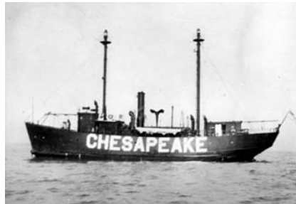
Chesapeake, in Calm Seas

A sense of the terrifying prospect of riding out an Atlantic storm aboard a lightship can be gained from the account of Mate R.A. Dixon who was aboard Lightship 116 Chesapeake during the hurricane of September 18, 1936 (note - it was not until 1953 that the National Weather Service began its practice of naming hurricanes).