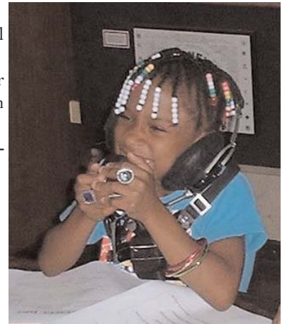
Damage Control Exercises with Sound Powered Head Phones on Board USCGC Taney

to help make my job easier and the kids really enjoyed all of the different activities." The museum also hosted over 400 overnight adventurers on board Constellation , Taney and Torsk . Overnight opportunities are still available for fall of 2008 right through December and the museum is accepting bookings for 2009 as well. For more information and to bring your group to experience one of our three overnight adventures, call Cliff Long at 410-539-1797, ext. 466 or reach him by e-mail at clong@constellation.org .