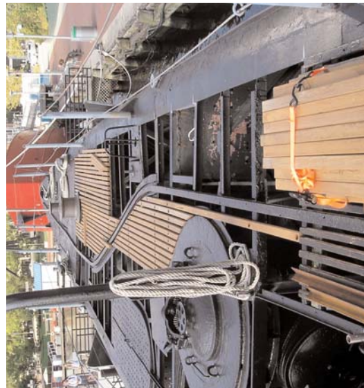
USS Torsk Receives a New Foredeck