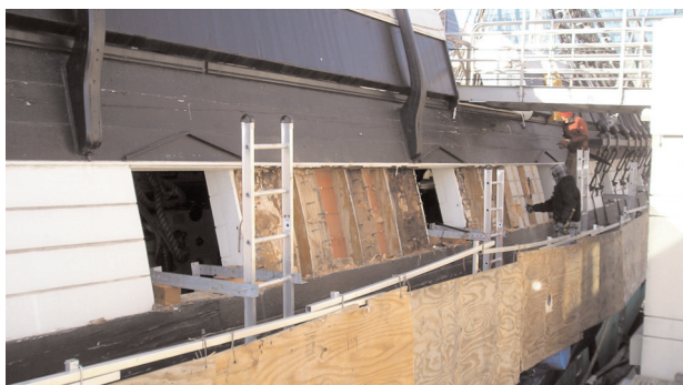
USS Constellation's port side opened up for necessary repairs

With temperatures dipping into the teens, I think that it is safe to assume that winter is officially here, and I am happy to report that we are ready for it! The deck awnings on Constellation and Taney are stowed and all of the hatches have been battened down. The heating systems on Chesapeake , Taney , and Torsk have all been repaired and are doing their best to keep our staff and overnight guests reasonably comfortable. No one on board will be running around in tee shirts this winter, but you won't be hearing any teeth chattering, either! Constellation doesn't have a central heating system like the rest of the fleet, but our portable electric heaters are all up and running to take the chill off for the adventurous overnights who want the more traditional experience of swinging in the hammocks on the berth deck.