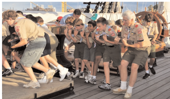
Scouts from Troop 944 heave on the capstan bars on board Constellation

There will be no extra charge for these programs and the plan will change daily. The addition of these engaging activities across the fleet is part of the museum's on going mission to bring the ships and their history to life.