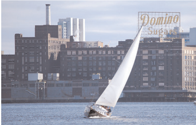
Encantada approaching the finish line

It was another blustery October day for the 2008 USS Constellation Cup Regatta. A fleet of forty boats braved the brisk fall weather for a day of fun on Baltimore Harbor. After the race, the captains and crews gathered on board Constellation to "spin yarns" about the day's events at the annual Bull Roast.