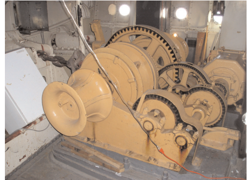
The anchor windlass room on board Chesapeake, almost ready for visitors.