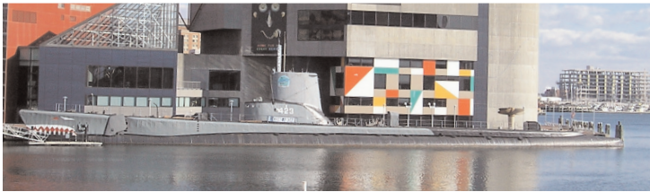
USS Torsk, moored in Baltimore Harbor

Commissioned on 16 December 1944, USS Torsk 's active career spanned some 23 years before being decommissioned on 4 March 1968. In her long and varied service with the US Navy, Torsk carried out a wide range duties which included successful war patrols in the summer of 1945, extensive use as a training boat at New London, and numerous deployments in the Atlantic Ocean and Mediterranean Sea through the mid 1960s.