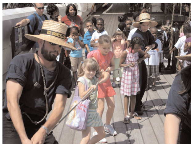
Hauling out the 20 pounder Parrott Rifle in preparation to fire

The second day, campers stepped off the bus and on to the 20th century Coast Guard Cutter Taney . Aboard ship, campers learned about the differences between the United States Navy and Coast