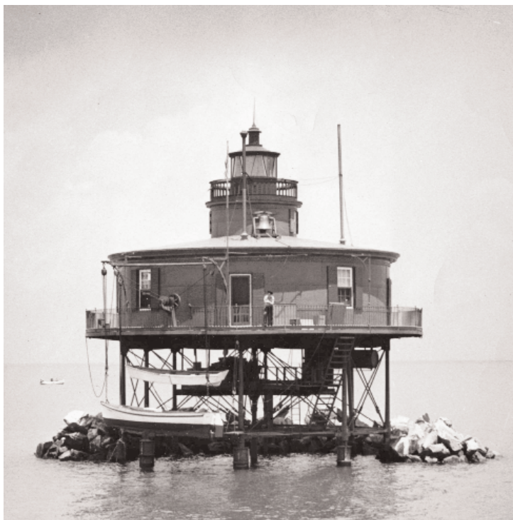
Seven Foot Knoll in its original position at the mouth of the Patapsco River, ca 1945

For most of its history, Seven Foot Knoll Lighthouse was manned by keepers of the US Lighthouse Service, and later the US Coast Guard. As an isolated station, Seven Foot Knoll was designed for three keepers - a principal and two assistants - which allowed for regular rotations ashore.