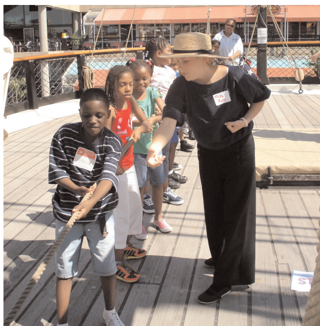
SuperKids Learn haul the braces on board USS Constellation

On the final day of camp, campers again boarded Constellation and explored her lower decks. Campers also learned how to operate one of the ship's 8-inch chambered shell guns and participated in a live firing demonstration of Constellation's 20-pounder Parrott Rifle. After the firing, campers rushed to their shipboard educators for hugs and good-byes and to thank them for memories of a life time.