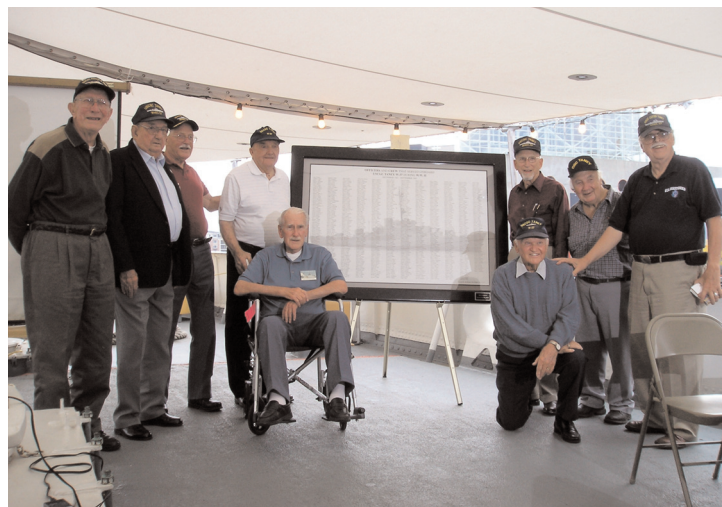
USCGC Taney's Crew, 29 September, 2009