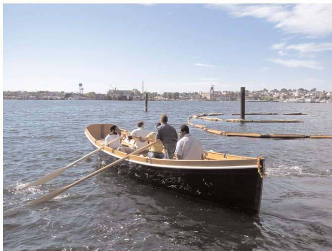
One of USS Constellation's Ship's Boats Underway after Launch

The Quarter Boats were launched, with much fanfare, on Friday, October 9th on the railway at Douglass - Myers Park. My bad back was acting up, preventing me from going out for a row, but Bruce and Chris reported that the boats row very easily. They are currently in the water alongside the East Harbor Campus, but we will soon be hauling them out for storage until funds for the davits can be raised.