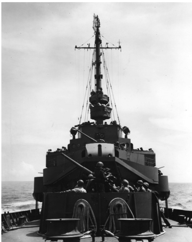
'Radar contact - 14 miles'. Here TANEY's forward 3"/50 gun crews train on the bearing of a Japanese "Mavis" flying boat during the first attempt at the July 1943 survey of Baker Island.

When TANEY steamed for Baker Island in mid July 1943 all hands were aware that encounters with Japanese warships and aircraft were possible. The crew was also aware that their mission would be to put ashore an armed landing force that would first sweep the island in search of any traces of Japanese activity before the airstrip survey began. Once the landing party went to work on