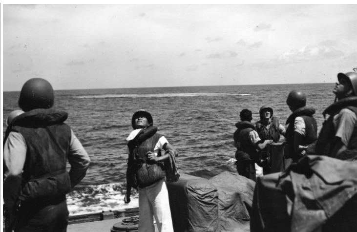
'Bomb splash - two sticks of 500-lb bombs.' Here TANEY crewman search the sky for the Japanese "Mavis" bomber. Note the disturbed area of water

Baker, TANEY would cruise offshore keeping visual, radar and sonar watches.