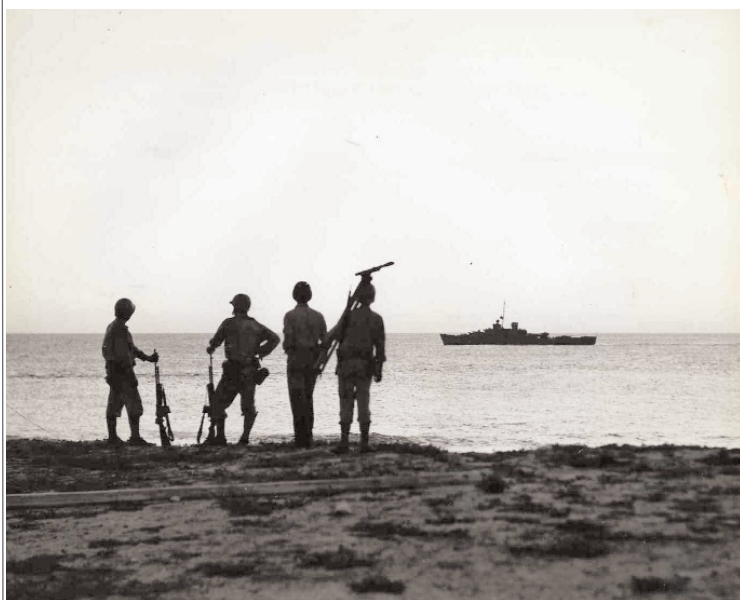
Members of an armed survey party from USCGC TANEY photographed on Baker Island in the Central Pacific, July 1943. TANEY is visible in the background.

Baker Island is roughly circular and approximately one mile in diameter. Treeless and dotted with scrub vegetation, it is home to a wide variety of sea birds and aquatic life. The island was claimed by the United States in 1857, and during the 19th century was mostly used as a source of guano for fertilizer. Beginning in 1935, a small number of inhabitants arrived under a short-lived US government "colonization" program instituted not only on Baker but on several other US equatorial possessions in the vicinity. During this period a navigational day marker, resembling a small lighthouse tower, was built, along with a radio station and a number of dwellings and supporting structures. Shortly after the start of World War II, the settlement was evacuated after being bombarded by Japanese ships and aircraft.