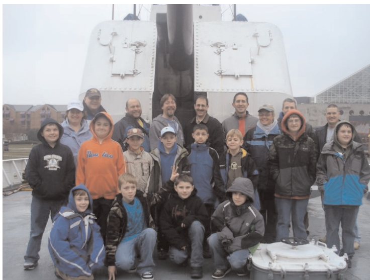
Cub Scout Pack 91 from Yardville, New Jersey