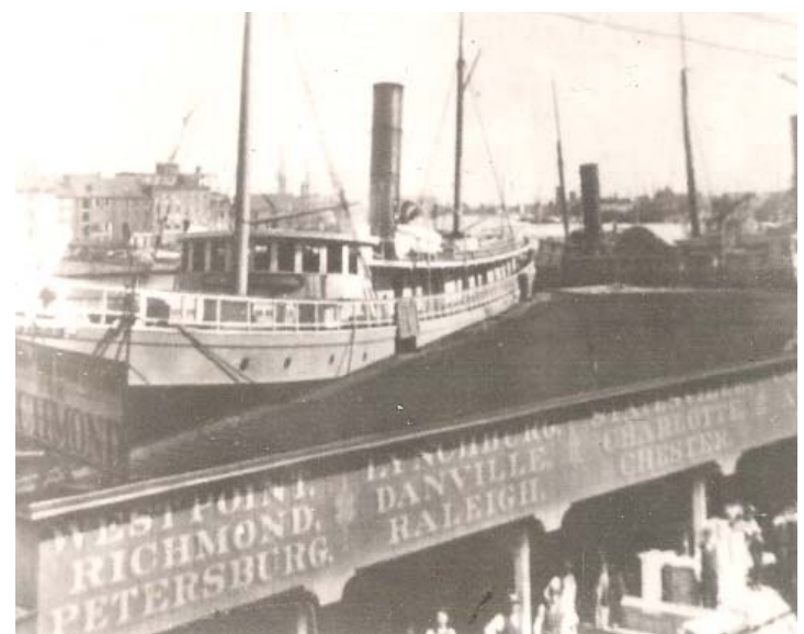
SS DANVILLE tied up along the Light Street waterfront, now Baltimore's Inner Harbor, circa 1890

In the days before interstate highways and airlines, Baltimore Harbor was an important transportation hub and steamships such as SS Danville were among the most familiar sites along the Patapsco River and the Chesapeake Bay. The display of the ship's bell from SS Danville at the Seven Foot Knoll Lighthouse re-establishes a connection between two elements of Baltimore's maritime history: the lighthouse itself which still exists, and the SS Danville which is gone forever.