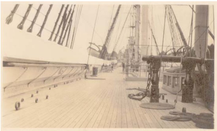
The Spar Deck of USS Constellation, ca. 1926