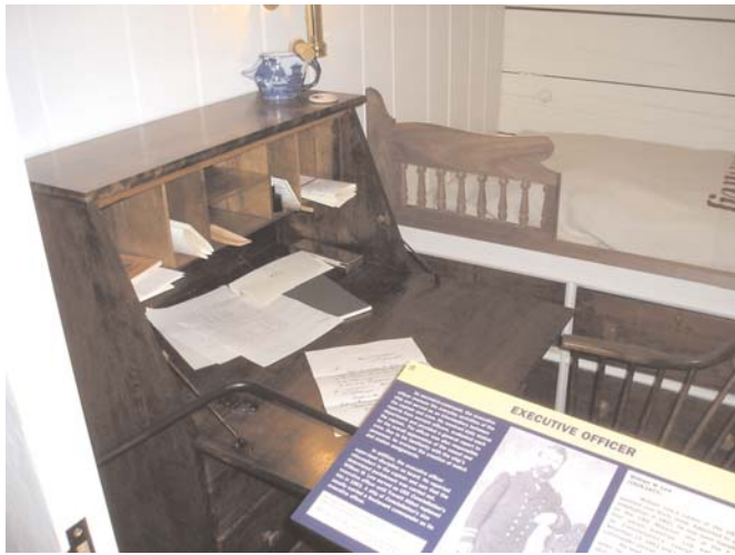
The Executive Officer's Cabin

WARDROOM, (CONTINUED FROM THE COVER) was sailing. Gone is the dark and dingy paneling and broken bunks. They are now restored, repaired, conserved, painted and varnished to look shipshape. New exhibits discuss the navy's officer corps and what it was like to be a leader in a time of great social upheaval and technological change.