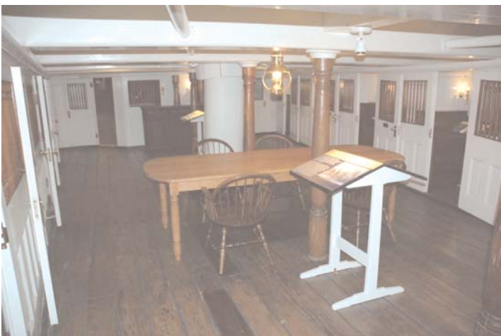
The Wardroom, From Aft Looking Forward