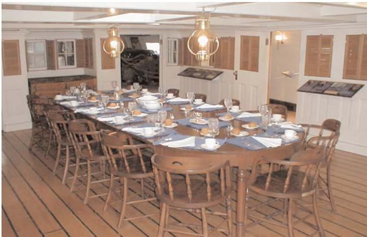
The Captain's Cabin Dressed and Ready for a Big Event!

For more information and to reserve your date please contact Laura Givens at 410-539-1797, ext. 432 or lgivens@constellation.org