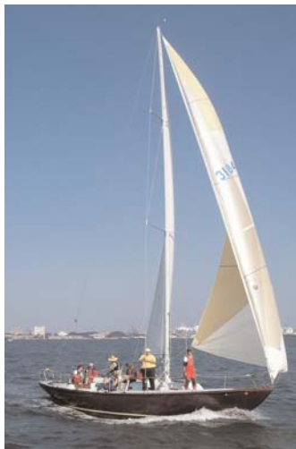
Alaris, winner of the 2005 Constellation Cup