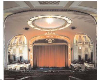
The Historic Maryland Theater

Join the Board, Staff, and Volunteers of the USS Constellation Museum on Saturday, December 2nd, for an entire evening's worth of quality entertainment in a unique atmosphere at the historic Maryland Theater in Hagerstown. Constructed in 1915, this beautiful theater was recently restored and is reminiscent of Baltimore's Hippodrome Theater.