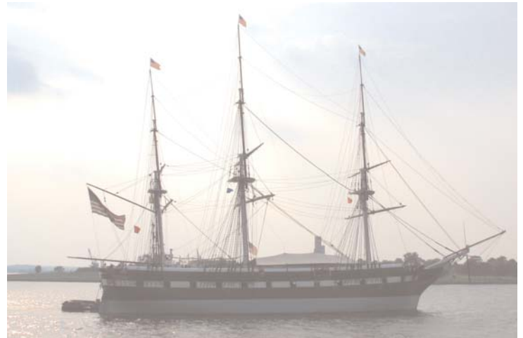
USS Constellation Underway - 9/8/06