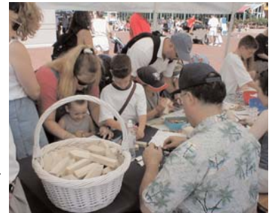
Kids making model boats at the Festival of the Sea

If books are on your gift list for the holidays, we hope that you will make a point of visiting Barnes & Noble in Towson, Maryland on December 8th to do your shopping. On that day, a portion of your purchase price will be donated to the USS Constellation Museum. You can also purchase via phone by calling the Towson store at 410-296-7021.